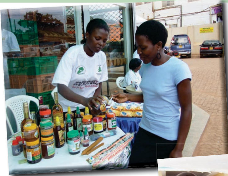
Volunteer, giving a consumer honey to taste during the satellite exhibition at Ntinda