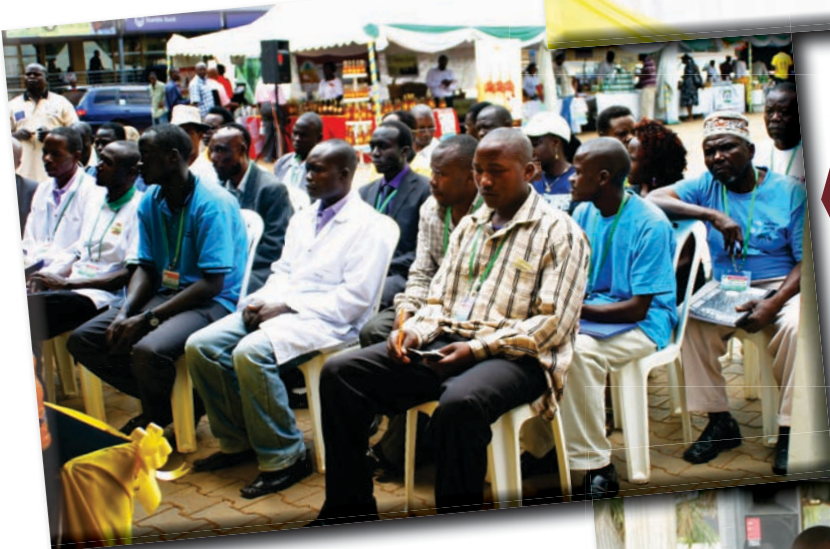
Exhibitors during the honey week closing ceremony