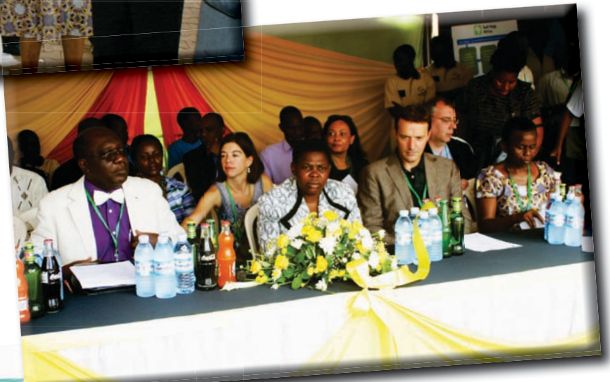
Invited dignitaries and guests during the honey week closing ceremony