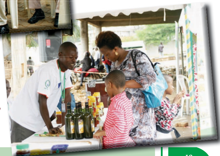
Exhibitor attending to the client during honey week