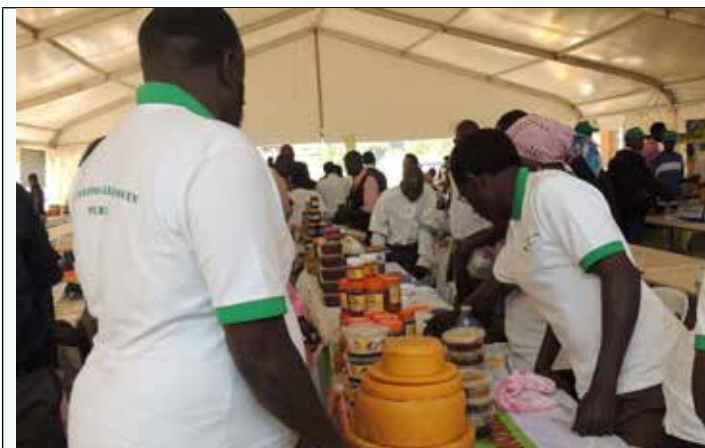
Some of the exhibitors at their stalls