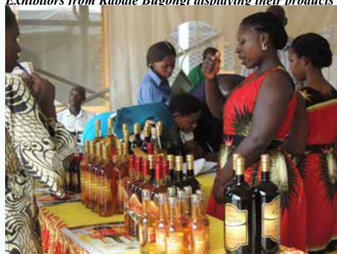
Bugaari winery at the exhibition