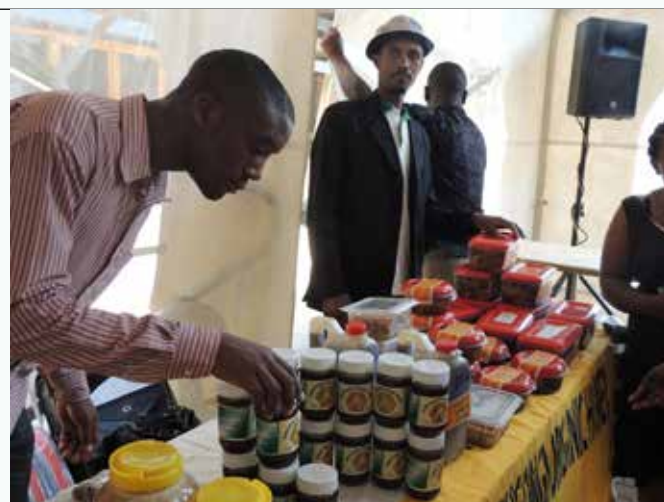
Exhibitors from Kabale Bugongi displaying their products