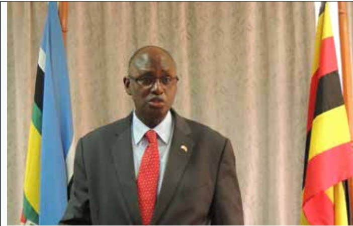
Hon Bright Rwamirwama Min of State for Animal Industry at the press conference