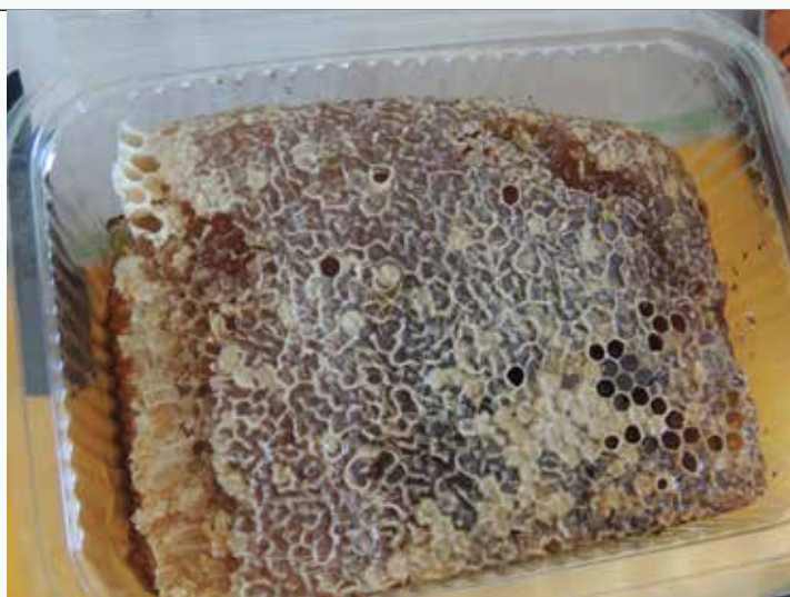
Honey combs ready for consumption and processing