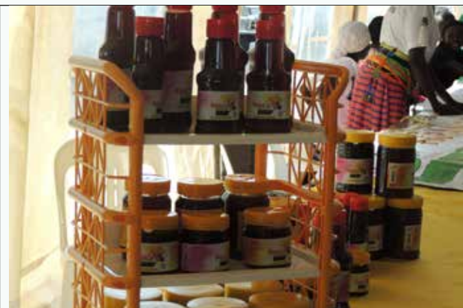
Some of the products on display