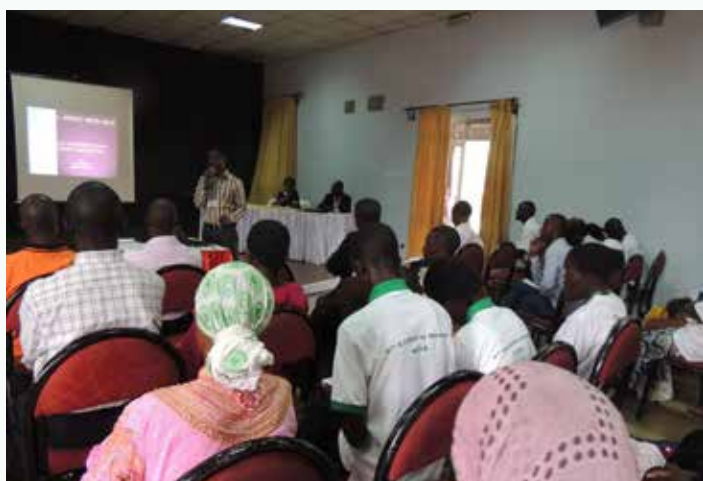
Participants during the youth panel discussion