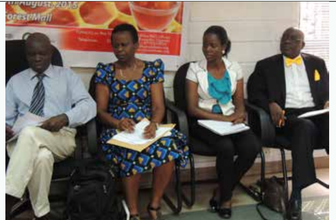
L-R Commissioner entomology, MAAIF, Principal entomologist MAAIF, Project Manager IMU Swiss Contact and chairman TUNADO at the press conference