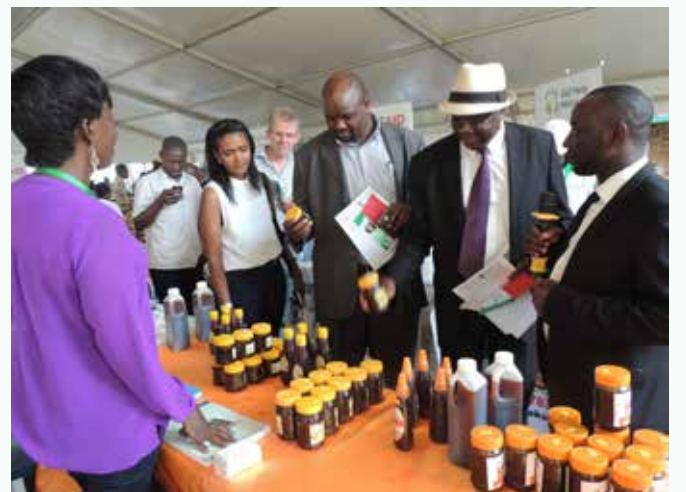
Guests led by Executive Director touring the stalls