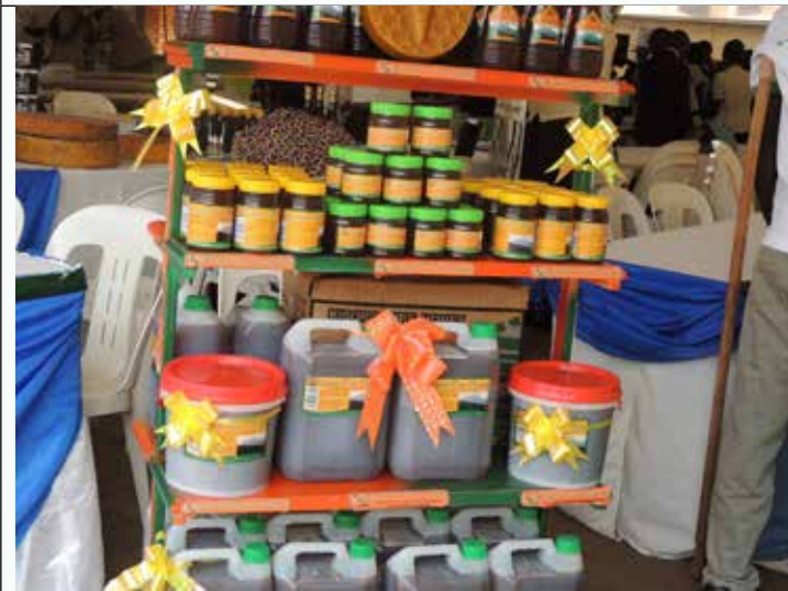
Some of the products exhibited