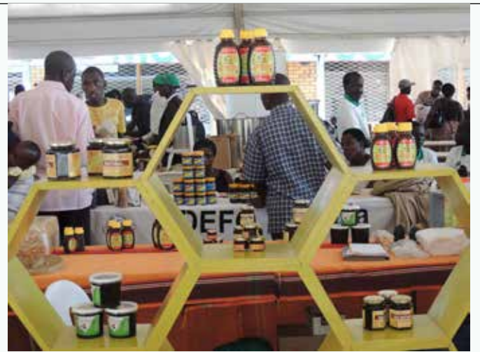
Exhibitors and patrons at the exhibition in Forest mall Lugogo