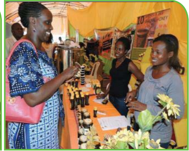
Exhibitors from Bee Natural Uganda attending to a client at the honey week